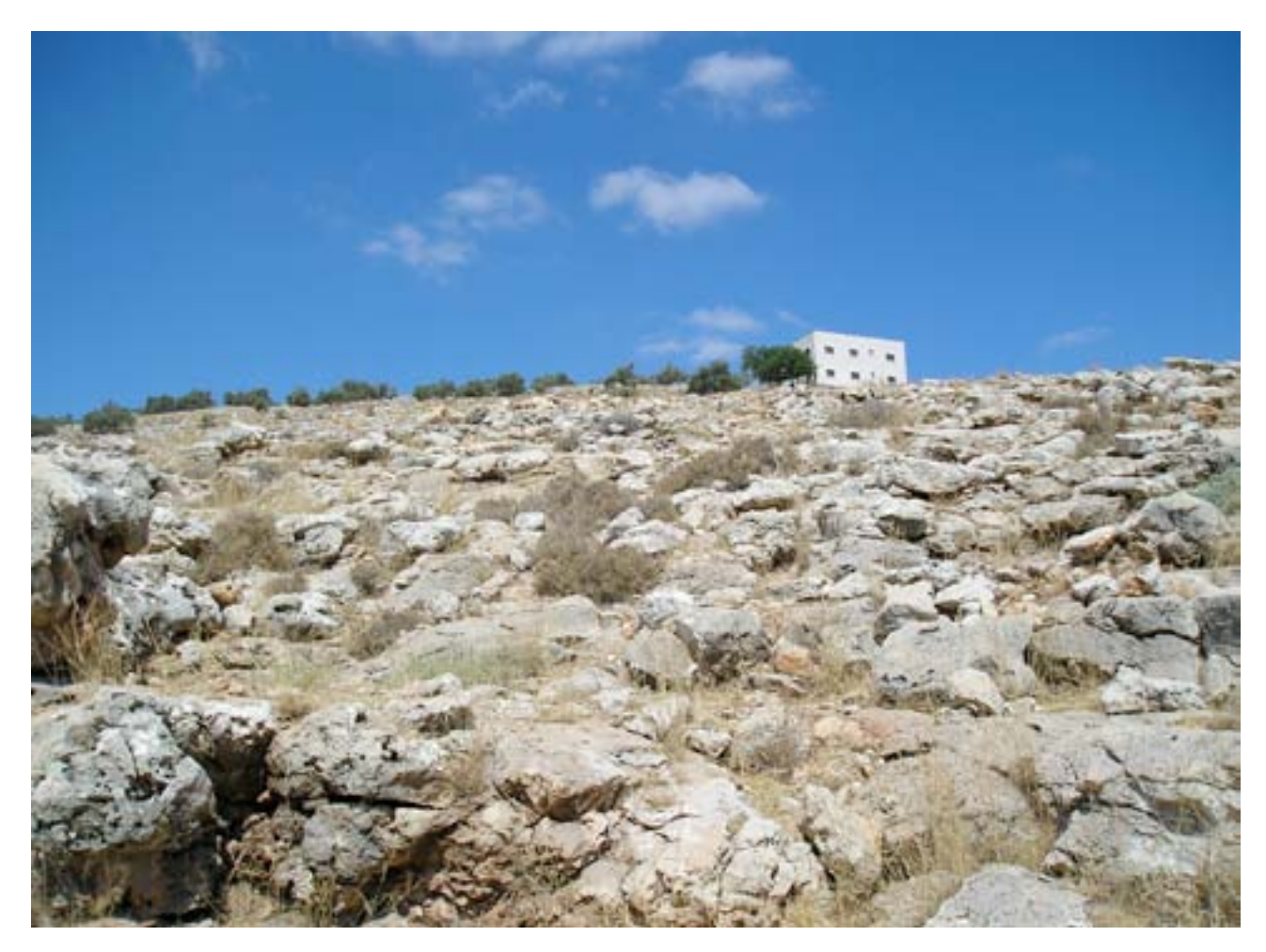
Fig. 3: Expansion of the built-up area around the cave at Wadi el-Natuf