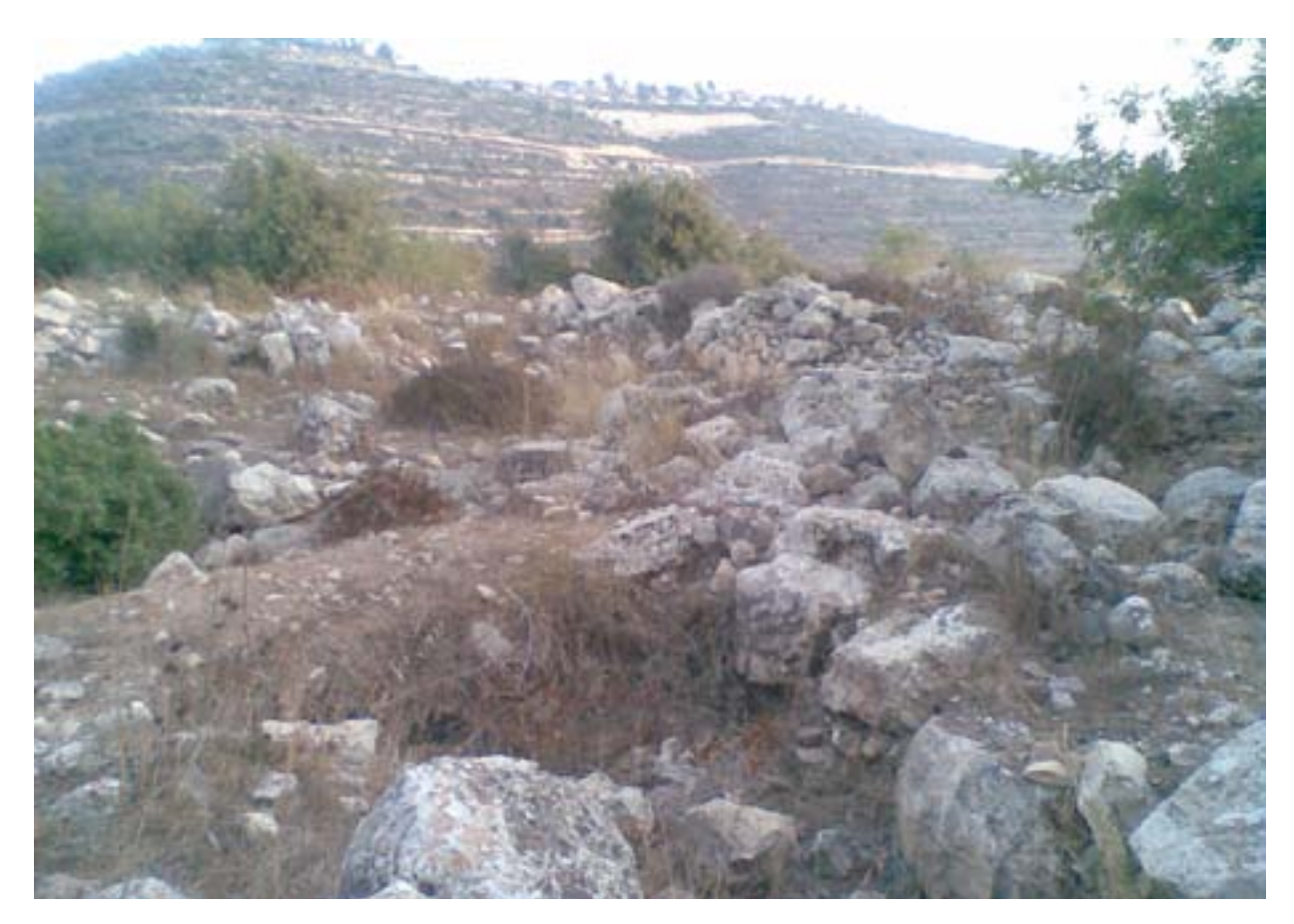
Fig. 6: Israelization process in the landscape of Al-Lubban village