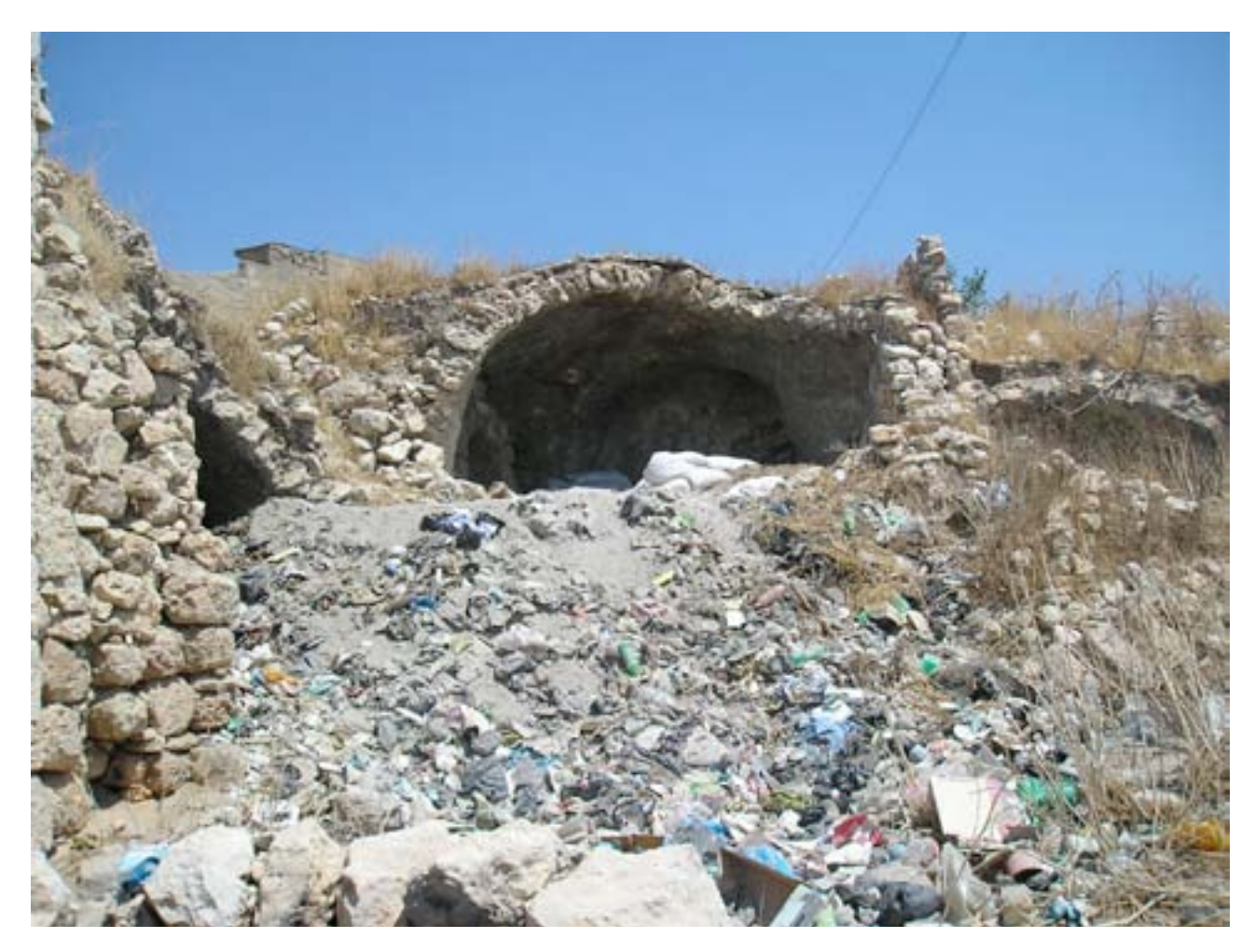
Fig. 2: Destruction of traditional architecture in Shuqbah.