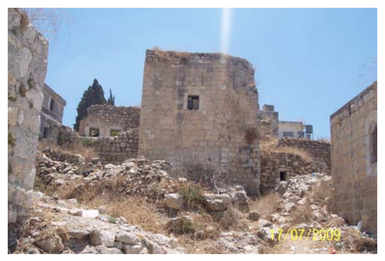
Fig. 4: Destruction of traditional architecture in Sinjil

The second problem in Sinjil is the expansion of the built-up area at the core of the traditional settlement, which was built on the remains of earlier periods, mainly the Crusader, Mamluk, early and late Ottoman. This area is now facing cultural destruction, firstly by damage to and neglect of traditional structures from the Ottoman period, and secondly by the digging of foundations and sewers, and through road construction.