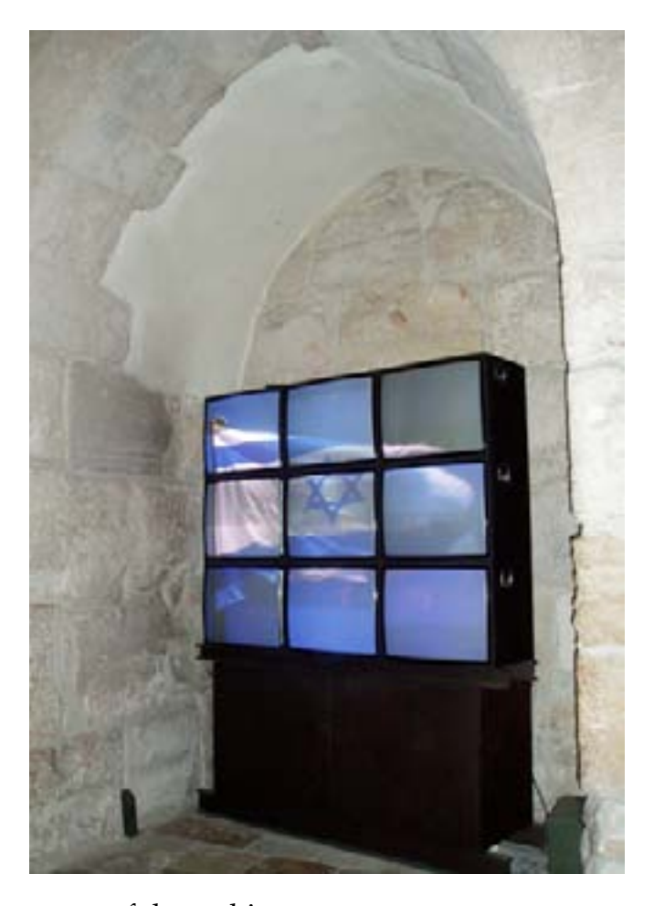
Fig. 3: Changing the context of the architecture

Since it has been designed as a "museum without objects", the Citadel serves only as a "historical setting" (according to the original curator of the museum, as quoted by Abu El-Haj, 2001: 171). The architectural structure of the Citadel and the excavated archaeological remains in the courtyard provide the museum with a general aura of historical continuity and longevity. The juxtaposition of the historical and the modern in it's design, and the fact that the Citadel's own history is not presented and interpreted in detail, are both essential to the credibility of the history that is exhibited. That history locates Jerusalem's origin, identity, and destiny in its role as the spiritual and political capital of the Jewish people. This is a story with Israelite origins and an Israeli ending. The first exhibition hall displays the First Temple period, which tells the story of David's conquest of the city and his transformation of Jerusalem into the spiritual and national capital of the Jewish people. It is the display of Jewish history in Jerusalem that is the thread of continuity that weaves together each subsequent exhibition hall and each succeeding era: the Babylonian exile or Second Temple period, Byzantine or early Islamic periods.