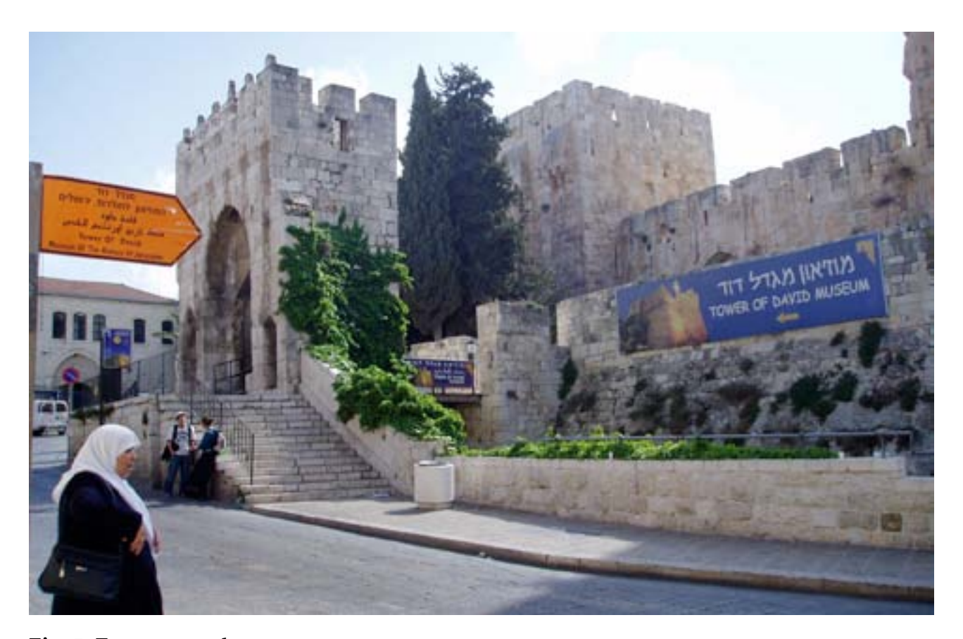
Fig. 5: Entrance to the museum

The name Tower of David is mentioned for the first time by the Italian pilgrim Piacenza (ca. 570), who reported that Christian pilgrims prayed at the site (Piacenza, 1896: 13ff). It seems that a popular legend in sixth century Byzantine Jerusalem associated the first century BC Herodian tower, which had survived to a considerable height, with King David. During the early Islamic period the site was converted into an Islamic shrine named Mihrab Dawud (David's Prayer Niche). The name Tower of David then survived in Crusader and Ayyubid times but only in relation to the north-eastern tower of the newly founded Citadel. However, in the nineteenth century Jewish and European travellers mistakenly gave the name Tower of David to the seventeenth century minaret of the mosque in the South-west tower of the Citadel. From that time on it has ironically become a Jewish symbol of Jerusalem, appearing on various objects such as plates and prayers books. Following Israel's occupation of Jerusalem in 1967, the Citadel was officially renamed as the Tower of David, and the new museum was established within it.