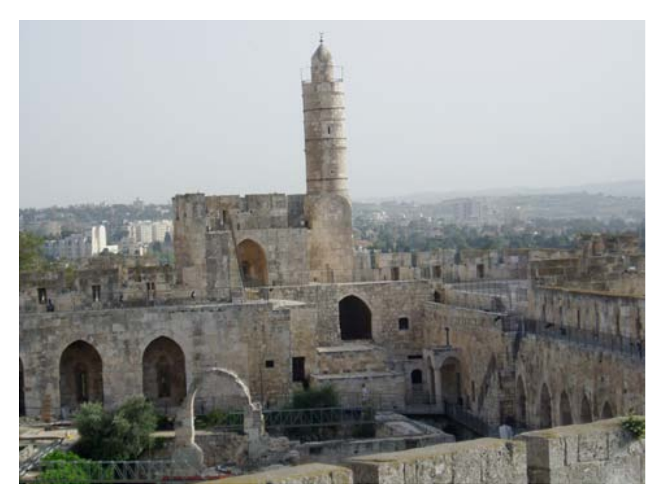
Fig. 1: The Citadel of Jerusalem

Extensive archaeological excavations at the citadel were carried out by C.N. Johns on behalf of the British Mandate Department of Antiquities of Palestine during the 1930s and 1940s. These excavations revealed a castle that is a remarkable example of Islamic and medieval military architecture (Johns, 1950). Its plan is an irregular rectangle consisting of curtain walls, connecting six massive towers around an inner courtyard; all are surrounded by a moat. It was essentially rebuilt by the Mamluk sultan al-Nasir Muhammad in 1310 over remains of fortifications from the Hellenistic, Herodian, Roman, Early Islamic, Crusader, and Ayyubid periods, as well as substantial additions from the Ottoman period. This formidable fortress was a centre of power and government that played a significant role in the political and social life of the city of Jerusalem until the early 20th century.