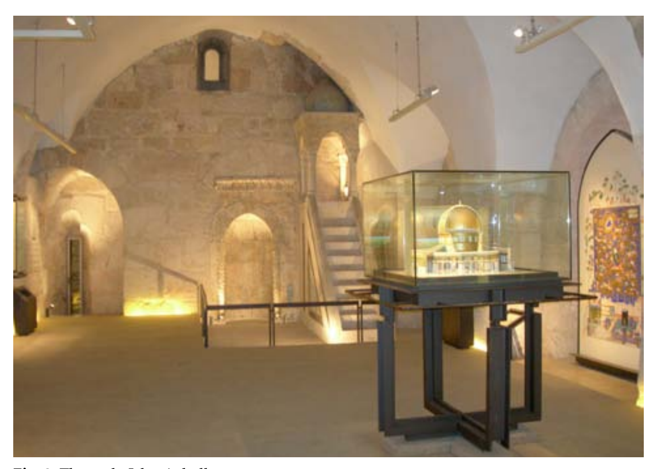
Fig. 2: The early Islamic hall

Founded in 1988, the museum named the 'Tower of David Museum of the History of Jerusalem' presents the history of Jerusalem by displays and modern visual techniques. The permanent exhibit has no archaeological artefacts and it consists almost entirely of reproductions of archaeological relics housed in other places, and reconstructions or simulations of architectural forms. It also makes use of maps, drawings, holograms and early films. The displays are housed in the halls of the towers surrounding and overlooking a courtyard full of excavated archaeological structures. Temporary exhibits and displays are organised either indoors or in the courtyard among the archaeological remains.