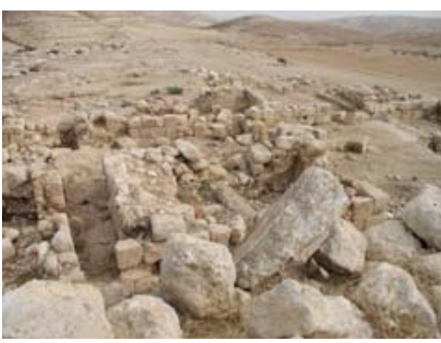
Fig. 4: The destruction of ruins at Khirbet al Qasir