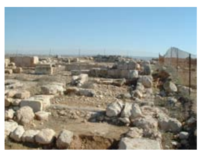
Fig. 5: The destruction of the mosaic floor at Fig. 6: The destruction of ruins at Khirbet Khirbet Anab al-Kabir