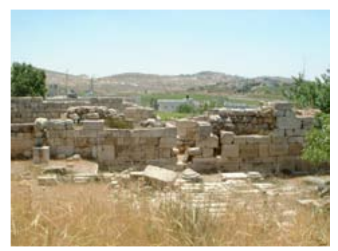
Fig. 3: The destruction of ruins at Khirbet Bait 'Anun

abandoned and left without any protection measures. Since the end of excavations, I have not returned to the site. It might be badly deteriorated. (trans. author)