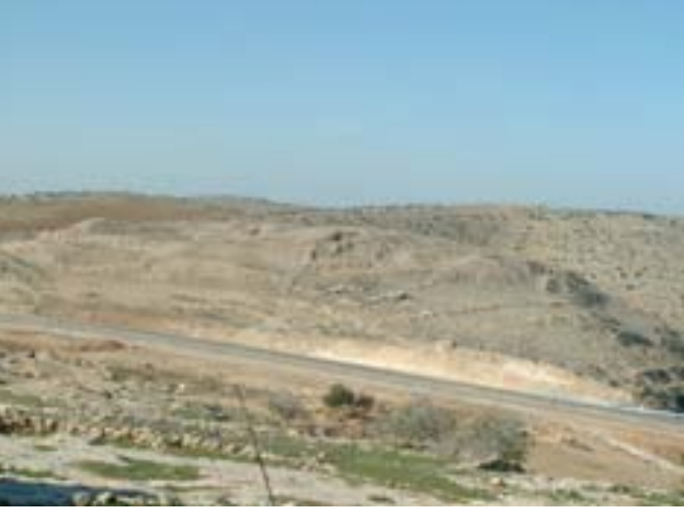
Figs. 7 and 8: The effects of the Separation Wall on Tell Bait Mirsim