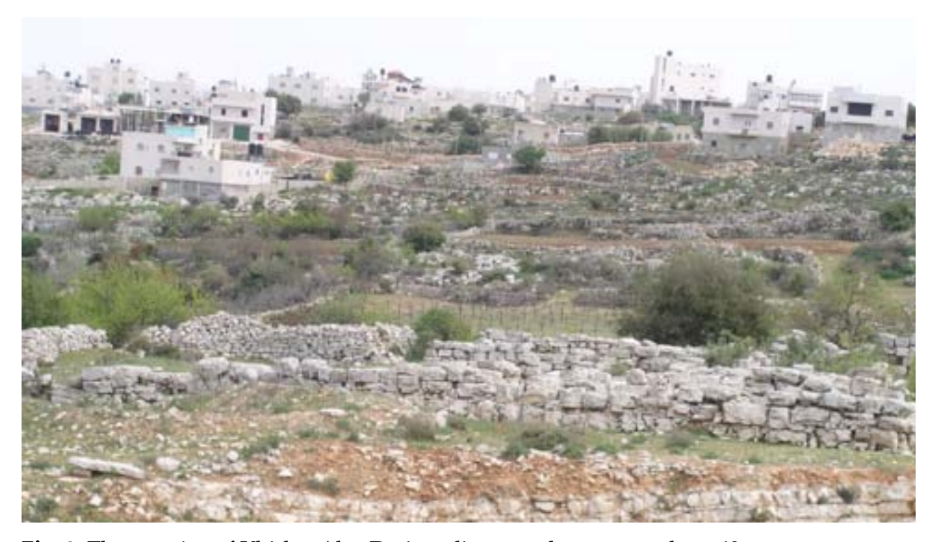
Fig. 2: The remains of Khirbet Abu-Dwier adjacent to by-pass road no. 60

Few genuine archaeological salvage excavations have been undertaken during construction of the roads. Khirbet Abu-Dwier, located Between Sa'ir and Halhoul on route 60 (figure 2), presents a dramatic example of these illegal activities. In 1995 its ruins, dating back to the Roman, Byzantine, and Ayyubid periods, were victim to the SOA's "salvage" work. The only information we have about these excavations is that many artifacts were uncovered and removed (Oyediran, 1997: 43). Transferring artifacts out of the OPTs violates the 1954 Hague Convention which imposes a duty on parties to prohibit, prevent, and if necessary halt acts of vandalism, theft, pillaging, and misappropriation of cultural property. It also requires states to refrain from requisitioning movable cultural property situated in the territory of another high contracting party (Hague Convention of 1954: article 4(3)).